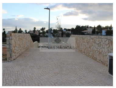
603 Land Area (m²)